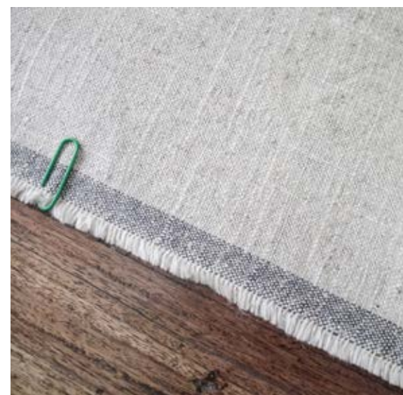
Linen 950 [ref IMA19] 55% Linen / 45% Cotton - Natural Gram - 280g Width - 140cm R150.00 per meter