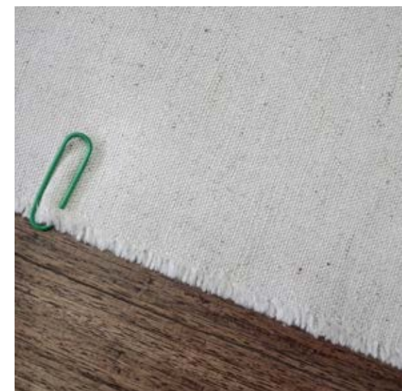
Linen J4 [ref IMA17] 100% Cotton - Optic White Gram - 315g Width - 142cm R87.95 per meter