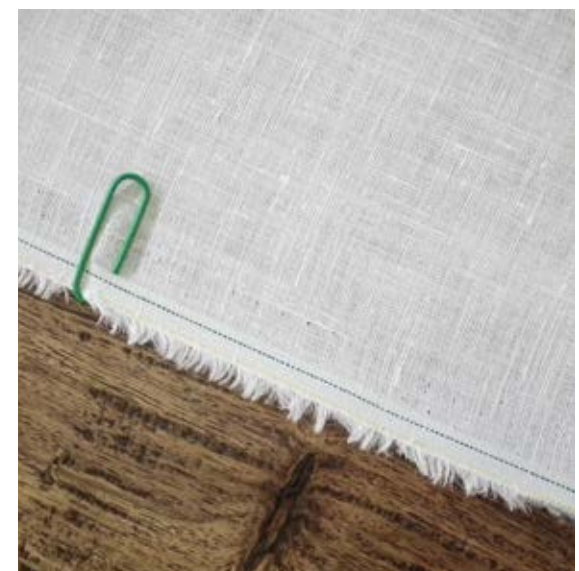
Light Linen [ref IMA11] 100% Linen - Optic White Gram - 150g Width - 140cm R115.95 per meter