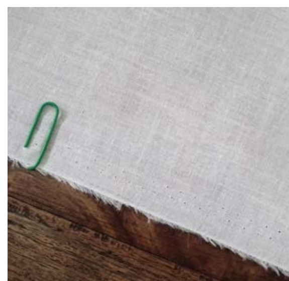
Lawn [ref IMA1] 100% Cotton - Optic White Gram - 71g Width - 140cm R69.95 per meter