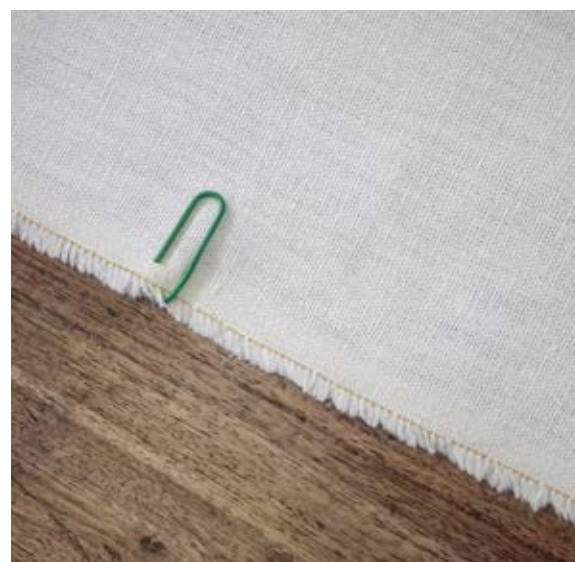
Hemp Medium Canvas [ref IMA25] 55% Hemp / 45% Organic Cotton - Natural / PFD Gram - 285g Width - 145cm R160.00 per meter