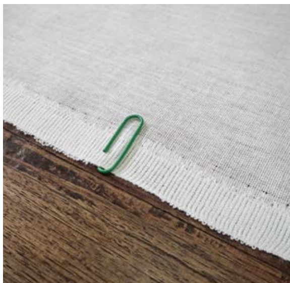
Muslin [ref IMA3] 100% Cotton - Optic White Gram - 89g Width - 147cm R55.00 per meter