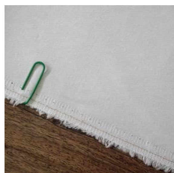
Twill [ref IMA8] 100% Cotton - Optic White / PFD Gram - 220g Width - 148cm R59.95 per meter