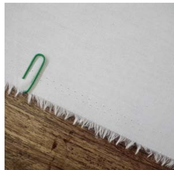
Poplin [ref IMA5] 100% Cotton - Optic White / PFD Gram - 119g Width - 147cm R70.95 per meter