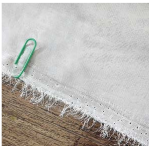
Chiffon [ref IMA7] 100% Polyester - PFD Gram - 60g Width - 145cm R60.00 per meter