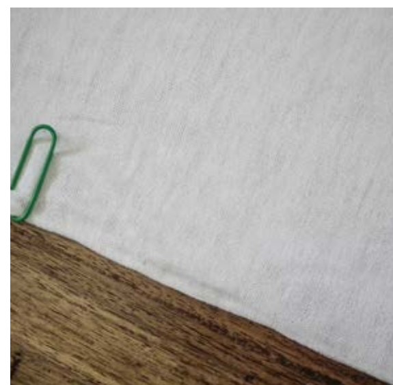
Single Jersey [ref IMA31] 100% Cotton - Optic White Gram - 160g Width - 170cm R55.00 per meter