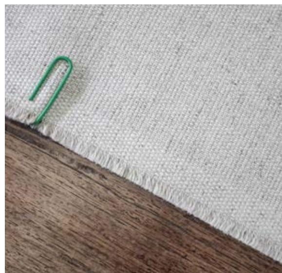
Linen T5 [ref IMA18] 50% Linen / 50% Cotton - Natural Gram - 309g Width - 146cm R110.00 per meter