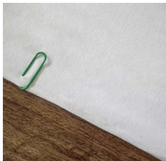
Cotton Spandex [ref IMA13] 95% Cotton / 5% Lycra - Optic White Gram - 180g Width - 170cm R62.00 per meter