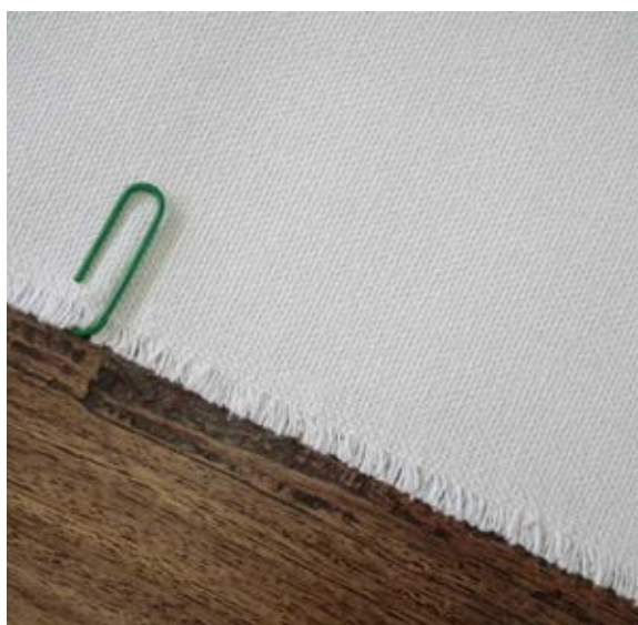
Canvas Bag [ref IMA22] 100% Cotton - White / Natural / PFD Gram - 355g Width - 150cm R89.95 per meter