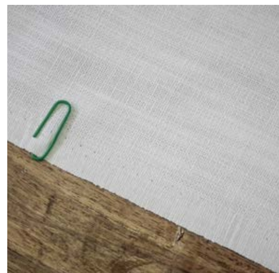
White Linen [ref IMA10] 100% Linen - Optic White Gram - 275g Width - 150cm R155.00 per meter