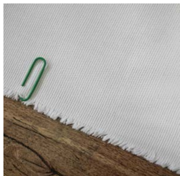
Canvas [ref IMA20] 100% Cotton - Optic White Gram - 245g Width - 150cm R73.00 per meter