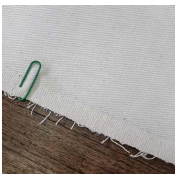
Bull Denim [ref IMA15] 100% Cotton - Optic White / Nat / PFD Gram - 265g Width - 150cm R75.00 per meter