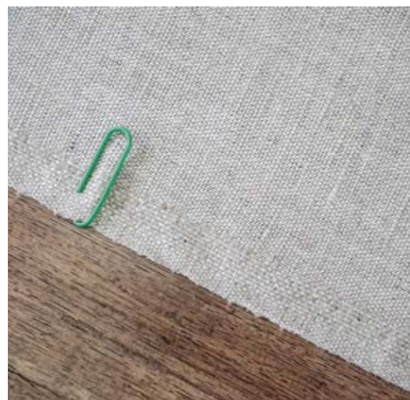
Linen 62 [ref IMA4] 60% Linen / 40% Cotton Gram - 205g Width - 150cm R115.00 per meter