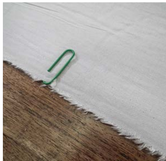
Rayon [ref IMA2] 100% Rayon - Optic White Gram - 120g Width - 140 cm R67.00 per meter