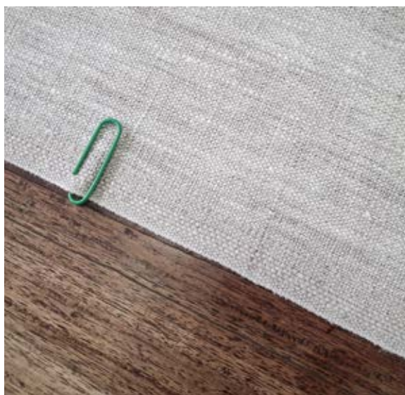
Linen 245 [ref IMA9] 100% Linen - Semi Natural Gram - 265 Width - 148cm R175.00 per meter