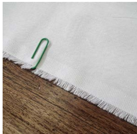
2/1 Fine Twill [ref IMA24] 100% Cotton - Optic White Gram - 145g Width - 150cm R65.00 per meter