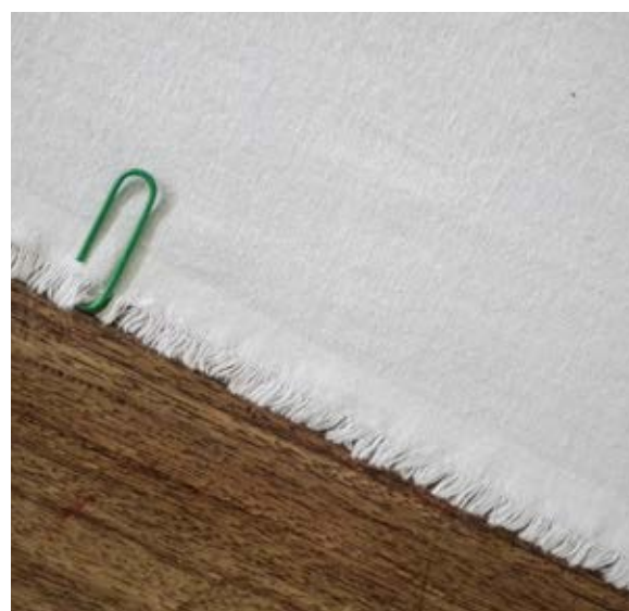
Cotton Square [ref IMA6] 100% Cotton - Optic White Gram - 130g Width - 156cm R55.00 per meter