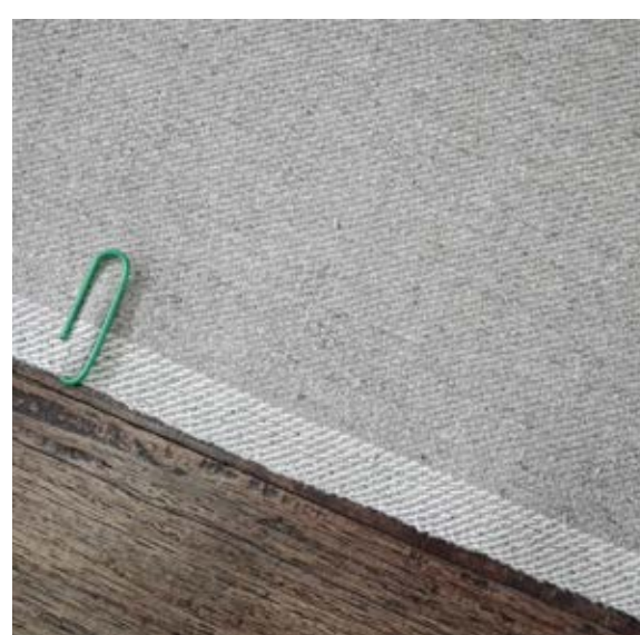
Linen 350 [ref IMA12] 75% Linen / 25% Cotton - Natural Gram - ±355g Width - 150cm R120.00 per meter