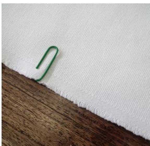
Canvas Pan Soft [ref IMA21] 100% Cotton - White / Off White Gram - 340g Width - 150cm R99.95 per meter